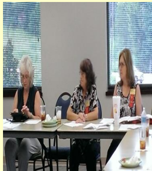
Roundtable Discussion 2