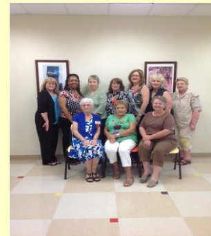
Members in Attendance 1