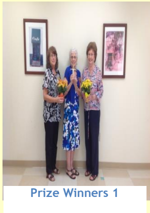
Prize Winners 1