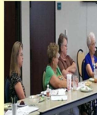
Roundtable Discussion 1