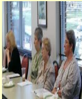
Roundtable Discussion 3