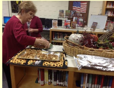
Delicious refreshments were enjoyed by all!