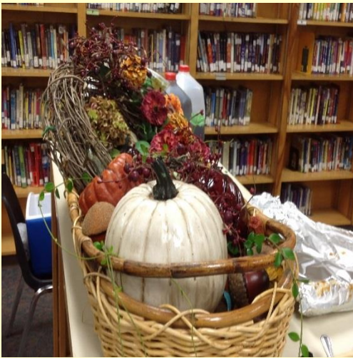
Fall was in the air.