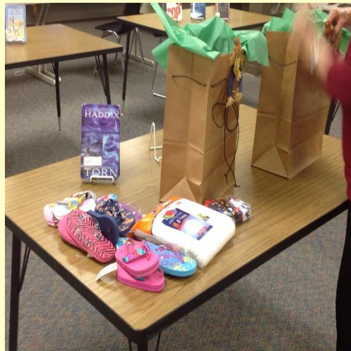
Items for the Pack the Bus project.