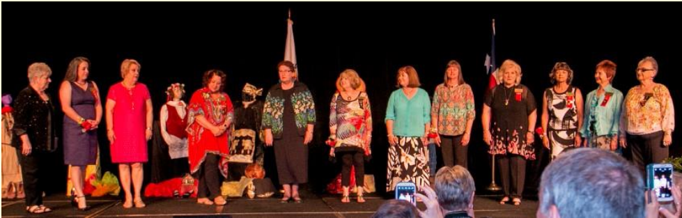
Area 2 Presidents