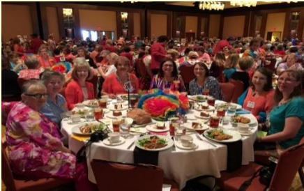
86 th Birthday Celebration