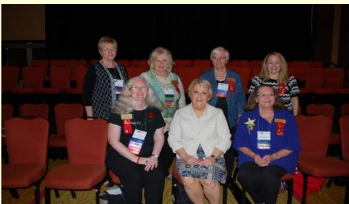
Honorary PACE Recipients